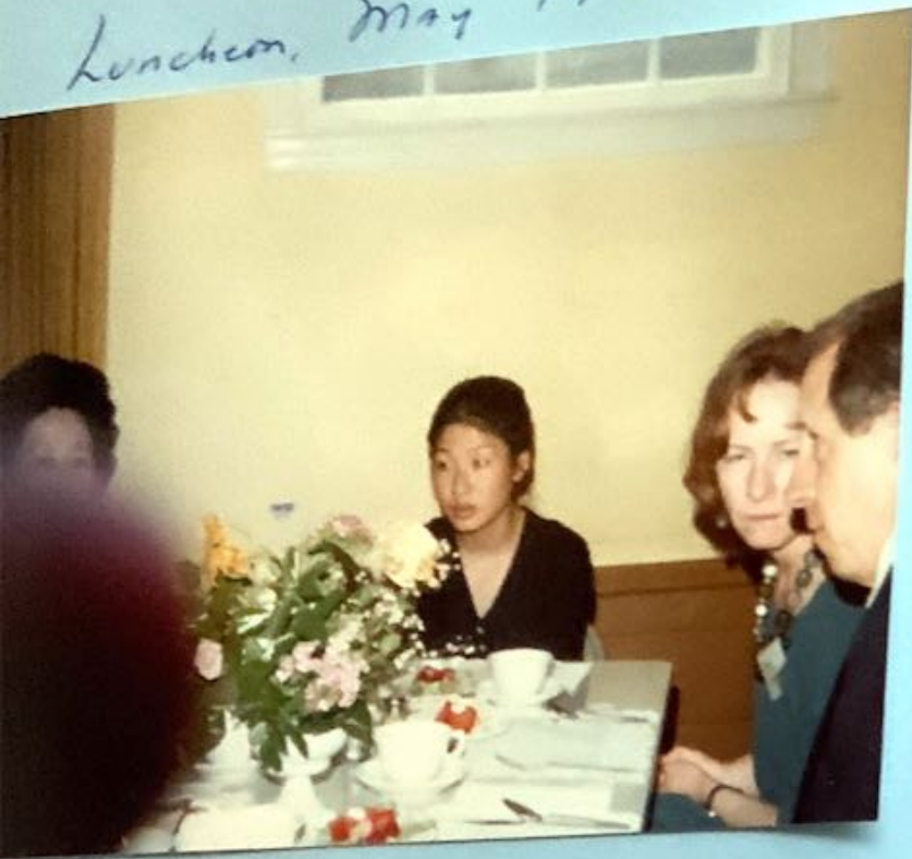
Luncheon, May 1979