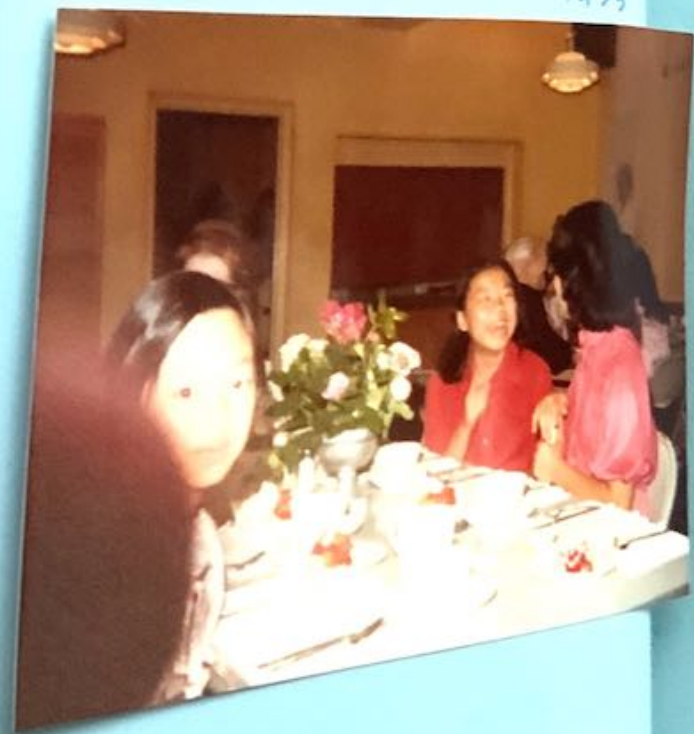
Student Competition Winner 1979