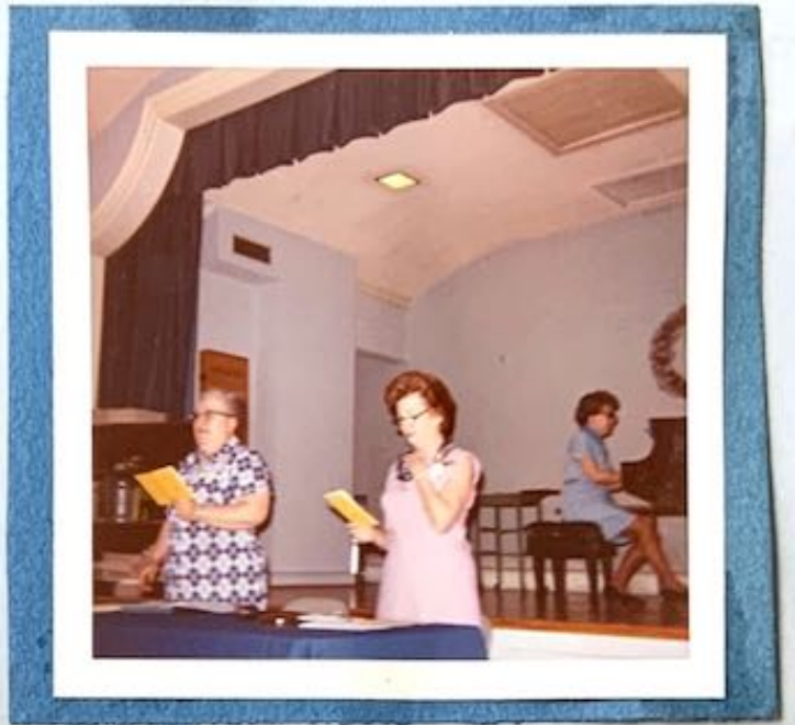
Hymn of the Month