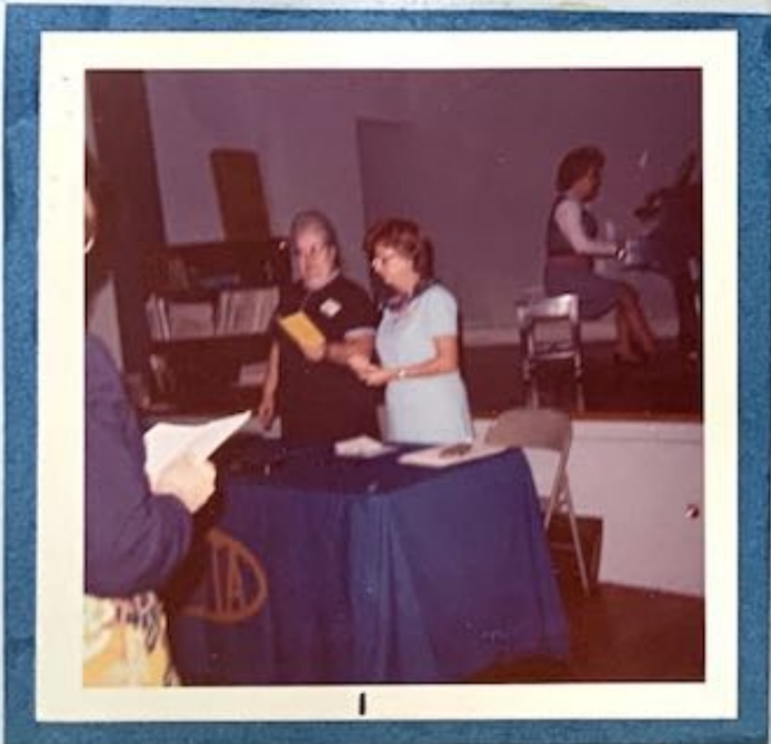
Another Hymn of the Month