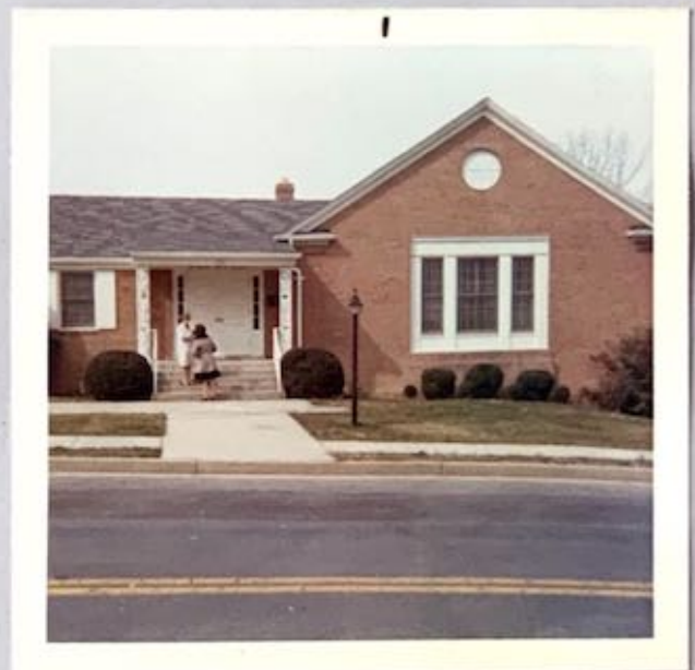
Women's Club of Arlington Our meeting place