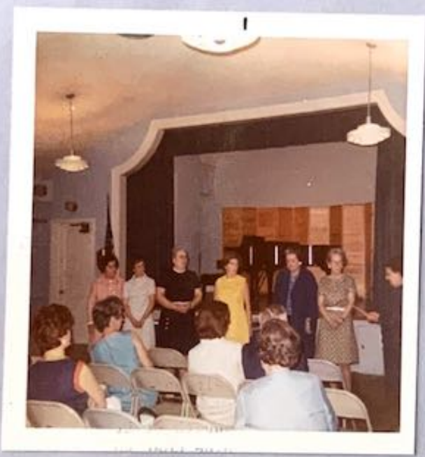
Luncheon at Evans Farm Inn